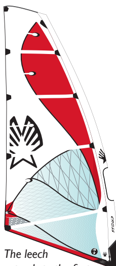
The leech extends to the foot batten on the 4.7 to 8.0.